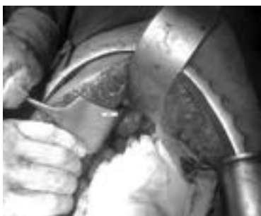
[Fig. No. 2] : Foregut cyst with surrounding organs

A smooth thin walled cyst measuring 10X8 cm in the subhepatic region lateral to the duodenum and the pancreas, superiorly and laterally liver, posterior and inferior relation to the kidney. The cyst wall was loosely adherent to all its relations. The cyst was enucleated